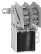
S86R Mounting Style 1